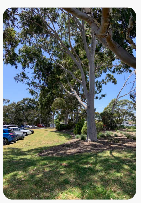
High quality landscape features provide amenity, and buffer the busy intersection.

The majority of the precinct falls outside of an open space catchment.