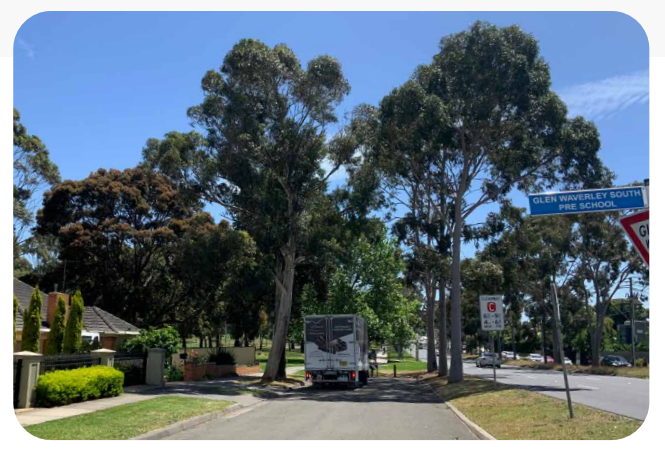
Canopy trees provided along service road, where verge and outer separator are of sufficient width.