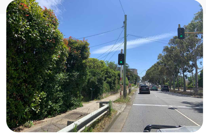
Lack of pedestrian amenity along sections of Springvale Road where no service road is provided

There are two signalised, pedestrian crossings at either end of this precinct, providing much needed connectivity for residents/visitors as they connect into Glen Waverley Activity Centre and Central Reserve. There are also other community and education facilities within this precinct.