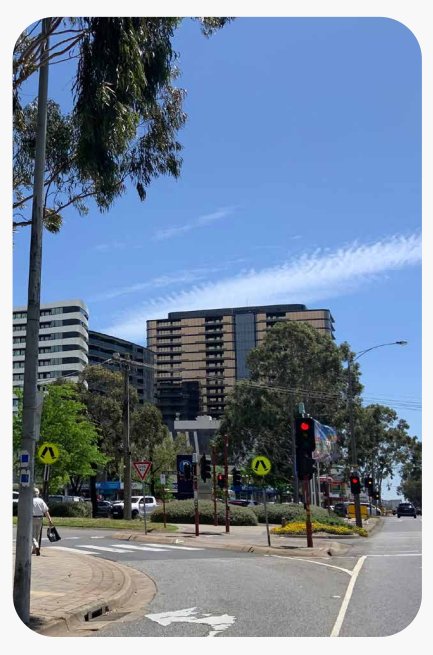
High quality landscape amenity provided at the entry to the GWAC.