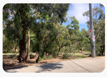
Landscape amenity provided via the PPRZ, north-west of the Main Street Road intersection.

The precinct is located within close proximity to bus and train services, with Glen Waverley Station walking distance from all sites in the precinct.