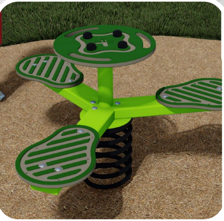
3 Person Rocker