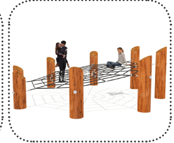
⑦ Spidergon Climber