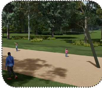
③ Flying Fox