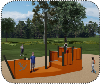
② Play Boat