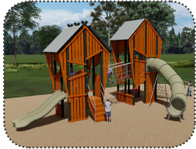
① Combination Unit