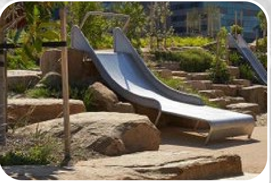
Mound Slide with Boulder Scramble