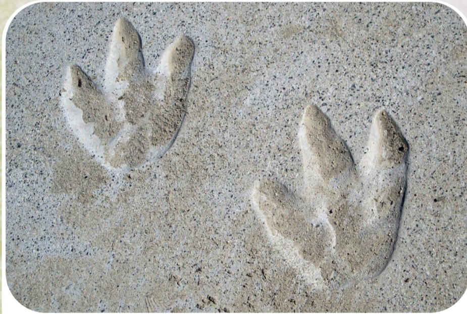
Dinosaur Footprints imprinted on Concrete Surfaces