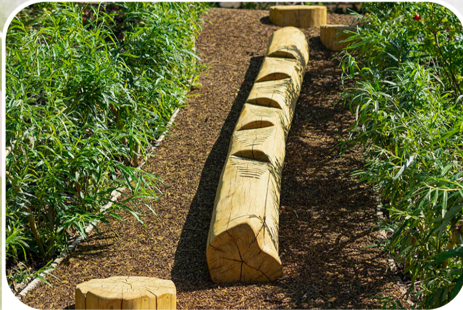
Timber Log Ladder