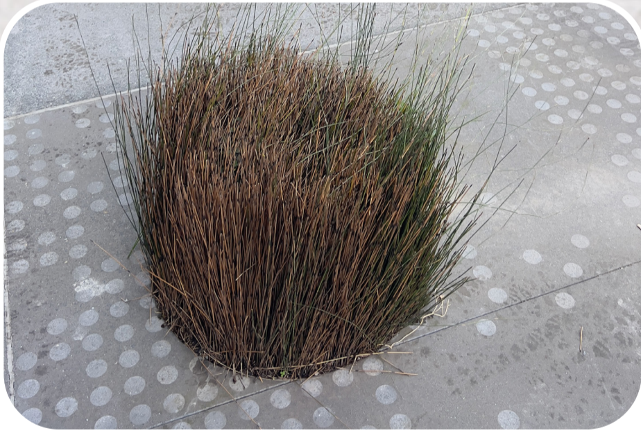
Circular Motif within Playspace Surfaces