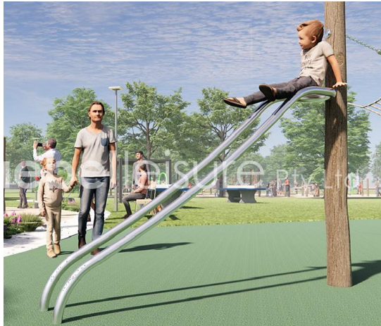
Double wave banister slide