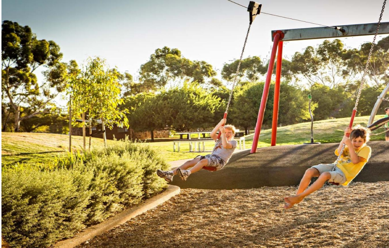
Flying fox (single line)