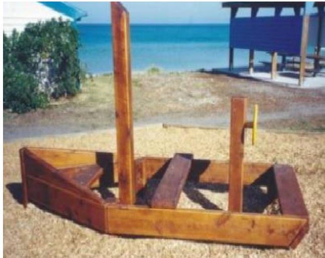
Pretend boats and other nature play items to encourage imaginative play