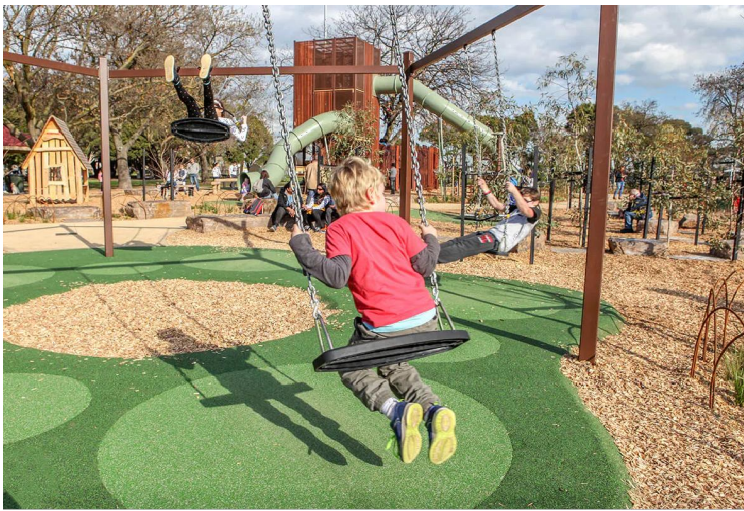
Swings including slings and toddler seats