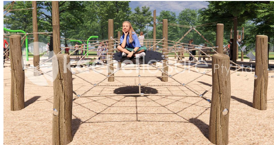
Spidergon with central bouncing membrane