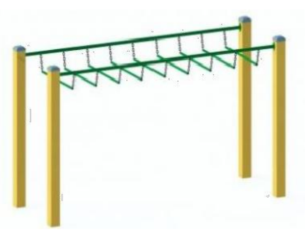
Swinging tarzan bars