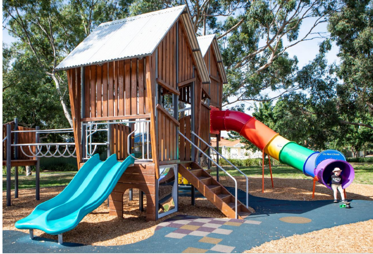
Multi use unit with slides, stairs, bridges, accessible ground level play panels and climbing opportunities