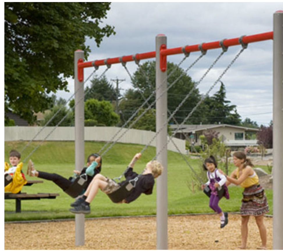
Swing set with two sling seats and two toddler seats