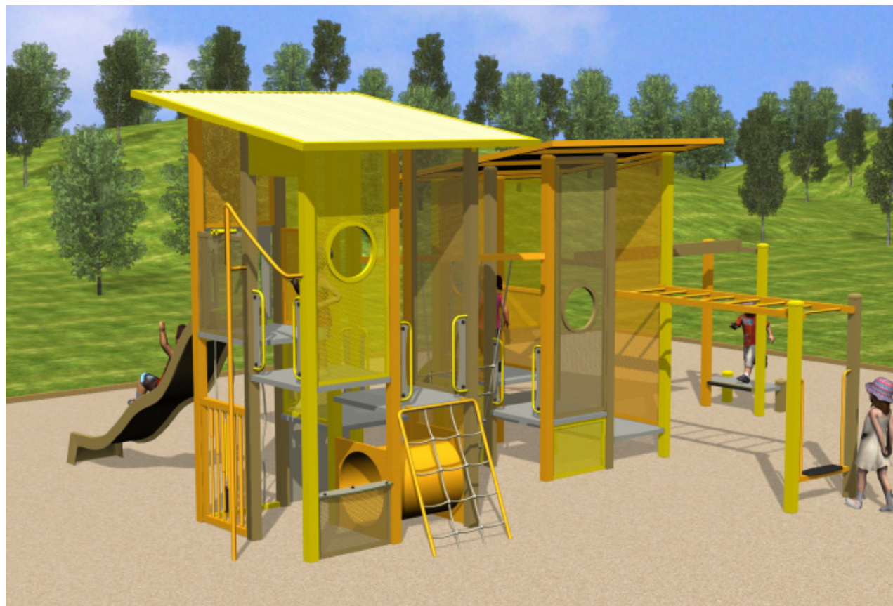
Multi-level custom play unit including monkey bars, track glide, junior and senior slides, tunnel, fireman's pole, sensory elements and climbing nets